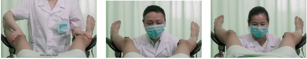
Figure 2 Vivian Qu, Angels Wear White . 2017. 92'57". The Nurse