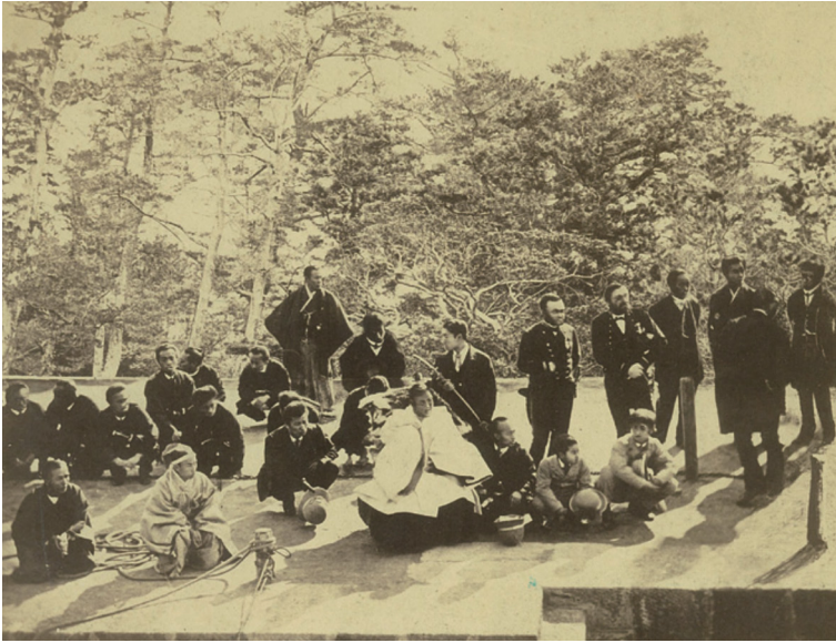
Figure 1 Baron Raimund von Stillfried, His Imperial Majesty the Tenno of Japan and Suite . 1 January 1872. https://upload.wikimedia.org/wikipedia/commons/6/63/Emperor_Meiji_Inaugurating_Yokosuka_Arsenal_Jan_1_1872.png

and their negatives were confiscated. The incident, however, had far-reaching implications for the government's policy of representing the emperor. As Luke Gartlan (2016, 73-100) has shown, there is a direct causal link between the illegal photograph and the subsequent total control that was enforced over the possession, display, and distribution of photographs of the emperor, as well as the official commissioning of imperial portraits by Japanese photographer Uchida Kuichi 内田九一 (1844-75).