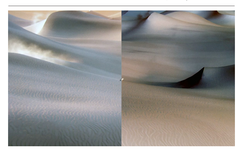
Figure 3 Jon Rafman, Remember Carthage. 2013. Single channel video, 13'43" min. © Jon Rafman, Courtesy the artist and Sprüth Magers

the digital space they occupy. While the notion of the archive has helped situate this space's structure, the question of memory as an active and subjective process of the mind remains to be explored as the central theme of the trilogy.