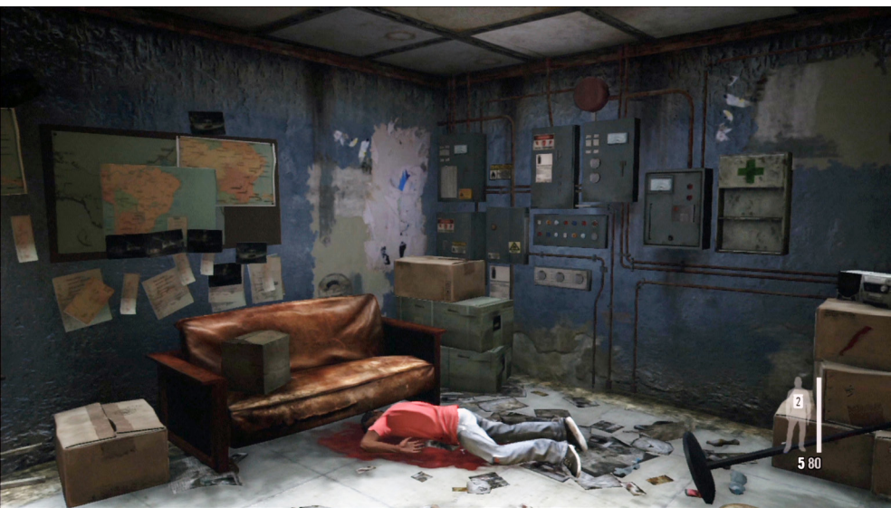
Figure 4 Jon Rafman, Remember Carthage. 2013. Single channel video, 13'43". © Jon Rafman, courtesy the artist and Sprüth Magers

Figure 5 Jon Rafman, A Man Digging. 2013. Video, sound, 8'21". © Jon Rafman, courtesy the artist and Sprüth Magers