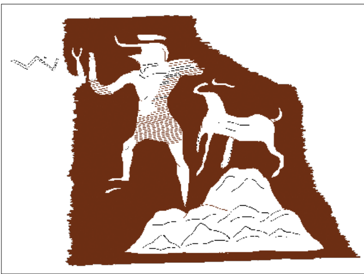
Figure 1 Seal impression from Urkesh (AKc21) showing a deity, presumably Kumarbi, walking on the mountains