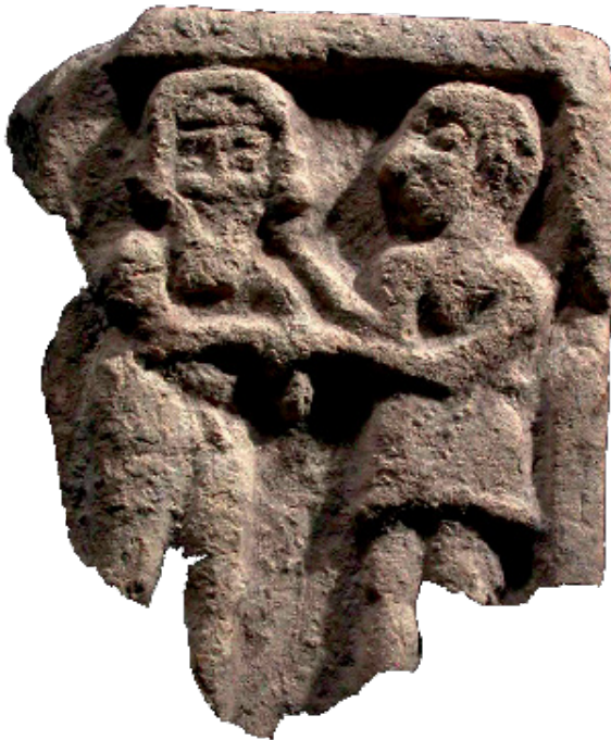
Figure 2 Upper right portion of a stone plaque from Urkesh (A7.36) interpreted as showing Gilgamesh and Enkidu