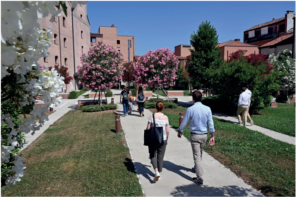
San Giobbe Economic Campus, Venice