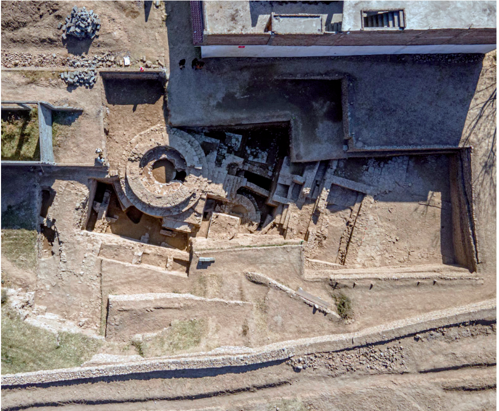
View of trench BKG 16 with the apsidal temple. The north is below.