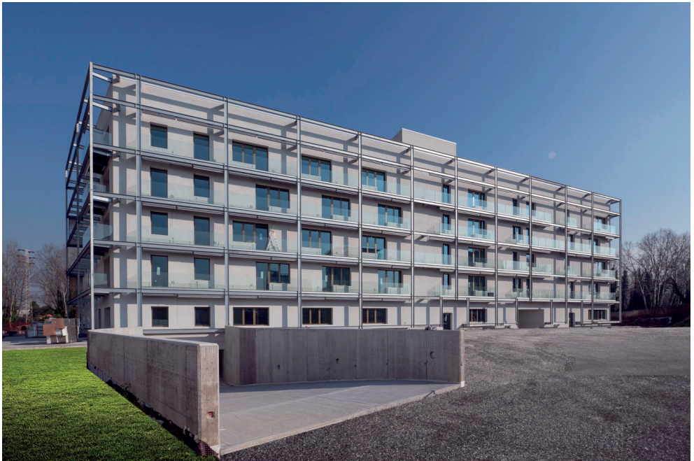
The University Residences of San Giobbe (Venice) and Via Torino (Mestre)