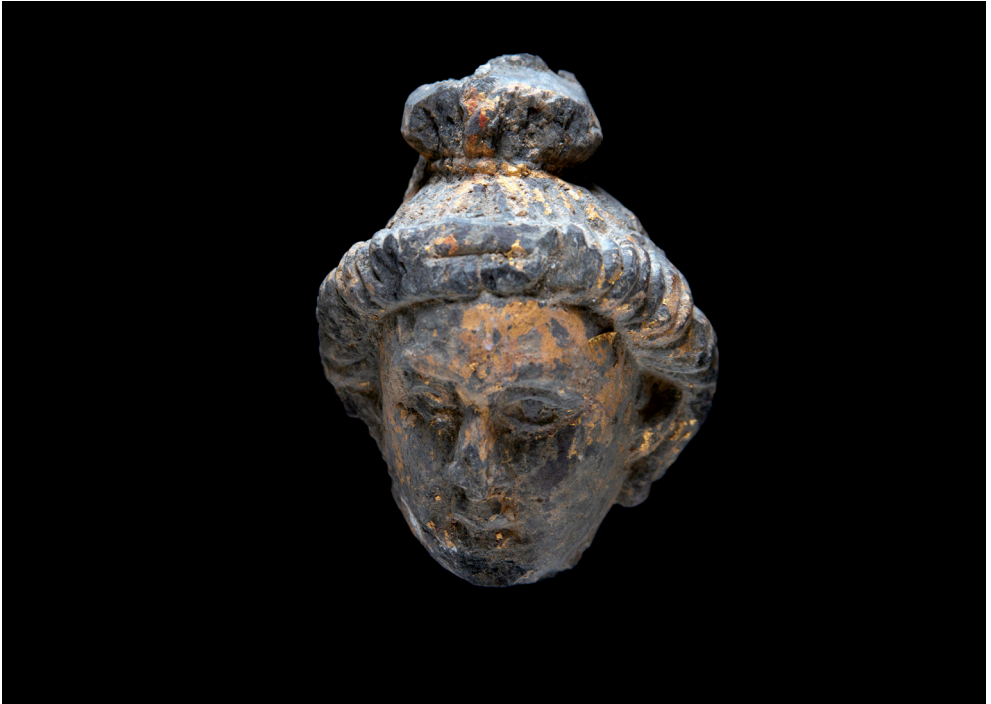
Gandharic figure from Barikot: bodhisattva.