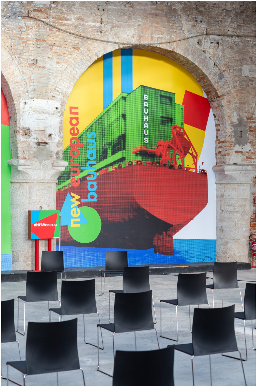
Conference Bauhaus of the Sea , 21st of September 2021, Venetian Arsenal