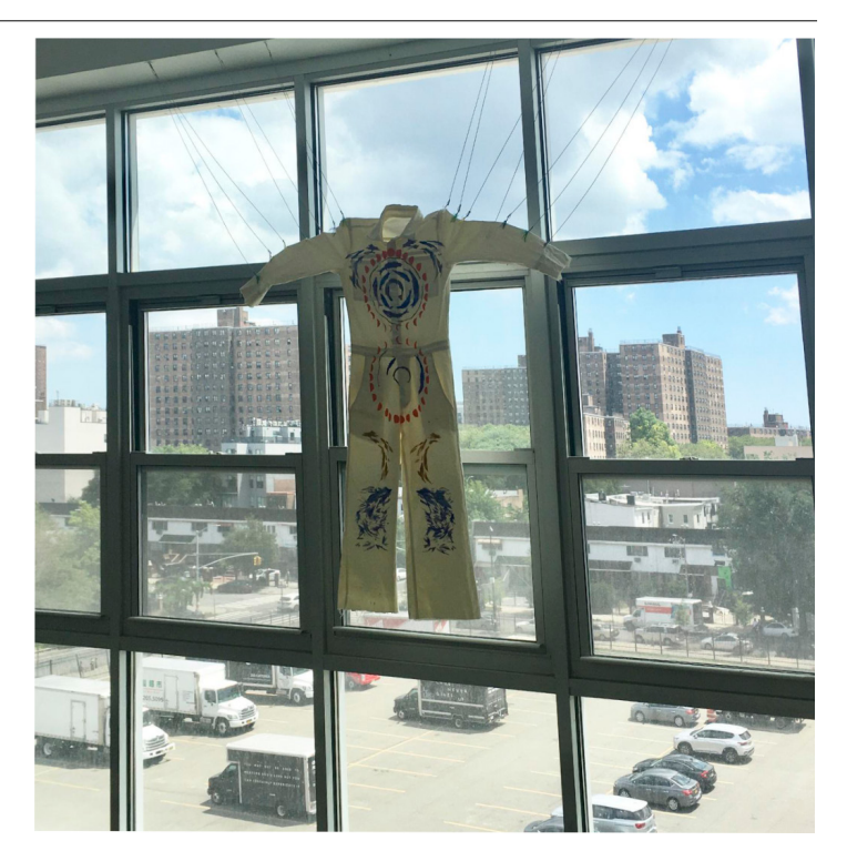
Figure 8 Zoë Fitzpatrick Rogers, BODY CLOCK . 2023. Ultramarine blue, ultramarine violet, cadmium orange, synthetic iron oxide, gum arabic on canvas, steel

Using an example of children's toys being the site of a border crossed, Chen analyses language from an article from the New York Times , recording a middle-class mother's perspective on the issue,