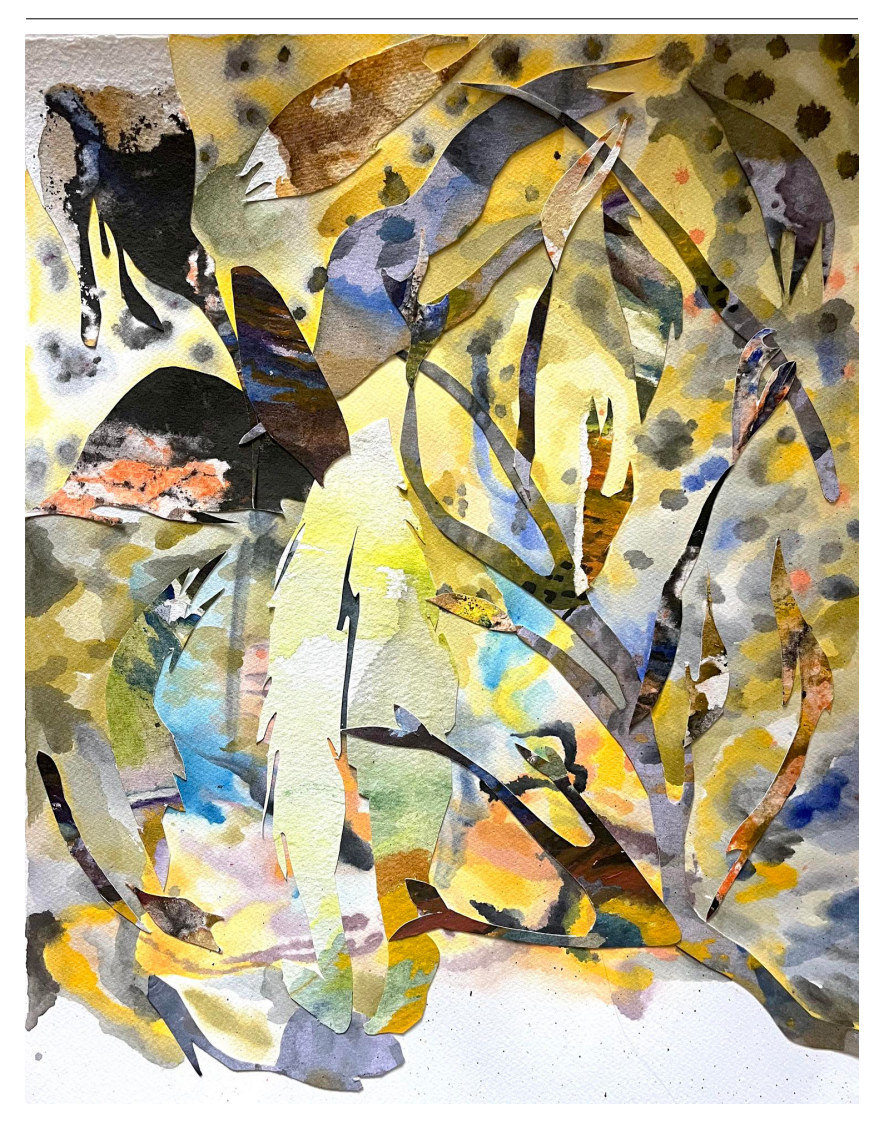
Figure 5 Zoë Fitzpatrick Rogers, VISION BOARD I. 2023. Cadmium yellow, cadmium orange, crap green, ultramarine purple, salvaged glitter, graphite, iron oxide, copier ink, Hurricane Henri (2021), on salvaged cotton paper

standpoint; as an artist not having scientific qualifications, or experience in law or public policy. In attempting to learn these systems of knowledge through my experience, I engaged with the idea that everybody in the city should have access to clean public water, and that this should already be in place, but under the logic of capitalism this is a radical demand. Alongside my practice, I teach boatbuilding to public school students across Brooklyn. Students collaboratively build an Optimist Pram in each classroom over a school year, using only hand tools, with four sheets of plywood. The students then sail in the East River, directly opposite the skyscrapers of Wall Street. I teach at a school in East New York that does not have clean drinking