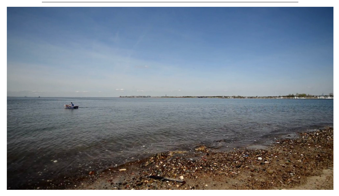
Figure 11 Zoë Fitzpatrick Rogers, UNTRAINED AMATEUR. 2022. Handmade boat. Performance, duration variable. Dead Horse Bay, Brooklyn, New York.

also leaving geologic traces in the city with my presence. I am inherently flawed in how I live versus what is happening environmentally in the city. We are deeply entrenched in each other. I am not separate [fig. 9].