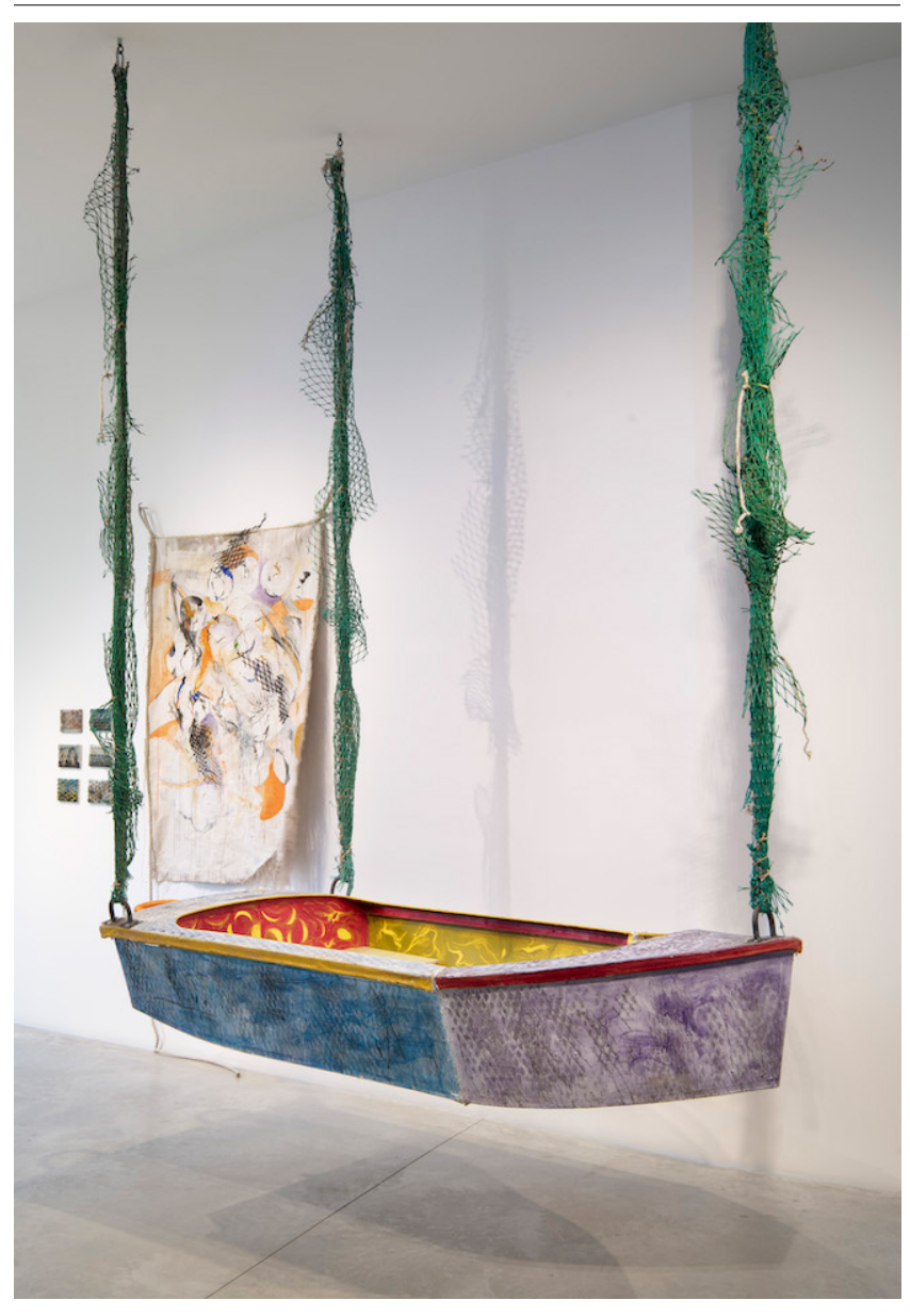
Figure 10 Zoë Fitzpatrick Rogers, UNTRAINED AMATEUR. 2022. Marine-grade plywood, salvaged wood, Titebond III, steel, fiberglass, cadmium orange, cadmium red, crap green, iron oxide, ultramarine blue, ultramarine purple, graphite, Thompson's Water Seal, duct tape, fishing net salvaged from Long Island fishery, and rope, 48 × 96".

of this herbicide drew inspiration from the U.K.'s employment of chemical agents during the 'Malayan Emergency'. In Vietnam, over 20 million gallons of Agent Orange were dispersed to decimate crops and forest canopies. Empirical studies have established that this synthesised chemical is linked to a multitude of health problems, including cancer, congenital disorders, dermatological issues, as well as severe psychological and neurological