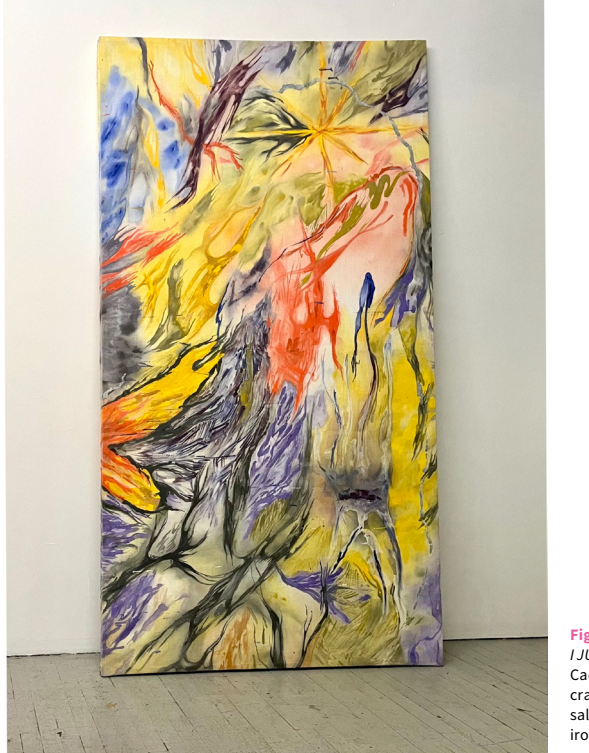
Figure 12 Zoë Fitzpatrick Rogers, IJUST WANTED YOU TO KNOW . 2023. Cadmium yellow, cadmium orange, crap green, ultramarine purple, salvaged glitter, graphite, iron oxide on linen

of the city. The boat is a form of connection to the water. It is a desire to intervene in historical sedimentary presence while remaining specific to its own material history. It transfers its form beyond a functional tool. A transformation of communication through performance; the nature of collaboration happening within the vessel.