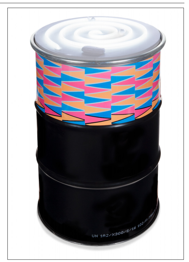
Gianni Macalli, The Refuse Light. 2017. Mixed technique: bin, synthetics, neon light and digital print, 95 × 60 cm

During the interviews it emerged that the artists were not completely aware of the potential of their artworks and participation in the exhibition as a first step towards entering the construction of an Italian nuclear cultural heritage, or towards opening the discussion on nuclear knowledge with the public at large. This lack of reflection on this point can probably be attributed to two reasons. Firstly, the purpose of the exhibition was not to focus on the nuclear archive itself, but rather on the decommissioning processes which are ongoing in Italy. Secondly, none of the artists were aware of the Nuclear Cultural Heritage project. Nevertheless, it was possible to initiate a reflection on archiving practices, although only two artists engaged in dialogues that sparked interesting aspects about it.