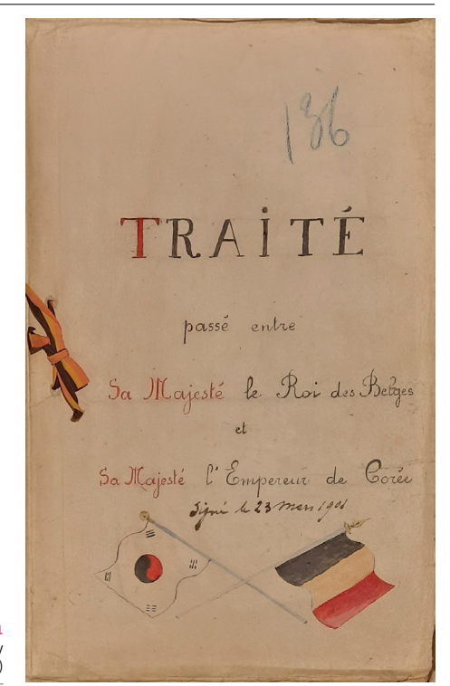
Figure 1 Copy of the Belgium-Korea Treaty in French (identified as copy 3-F)

was instructed to exchange in Seoul for the one ratified by Kojong, 89 copy 2-C in Chinese. The ratified copy 2-C and the proces-verbal of the exchange of the instruments of ratification (in both Chinese and French) were entrusted to a Belgian diplomat posted in Beijing who was temporarily staying in Korea while on his way to Belgium. 90 The Belgian Ministry of Foreign Affairs acknowledged receipt of this copy in December 1901.91