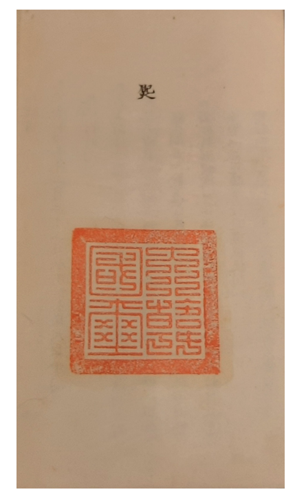
Figure 4 Great Seal of Korea affixed on the instrument of ratification contained in copy 2-C of the Belgium-Korea Treaty

the inscription "Traité passé entre Sa Majesté le Roi des Belges et Sa Majesté l'Empereur de Corée" and an illustration of the two national flags. The two copies in Chinese, 2-C and 3-C [fig. 2], bear the signature of Léon Vincart, the seal of the Belgian consulate general in Seoul, and the seal of the Minister of Foreign Affairs. Their covers are slightly different; the cover of the ratified copy 2-C bears the inscription "Treaty of Commerce between the Great Korea and the Great Belgium" (Tae Han'guk Tae Pirisiguk t'ongsang choyak 大韓國 大比利時國 通商條約) whereas that of copy 3-C bears the inscription "Treaty of Commerce between the Great Belgium and the Great Korea" (Tae Pirisiguk Tae Han'guk t'ongsang choyak 大比利時國 大韓國 通商條約). Furthermore, copy 2-C contains on the last pages of the treaty the instrument of ratification [fig. 3] with the Great Seal of Korea (Tae Han kuksae 大韓國璽) [fig. 4] affixed. The French copy 1-F that was supposed to be kept in the Belgian consulate is missing. In 1917, Belgium decided to close its consulate in Seoul and entrust its