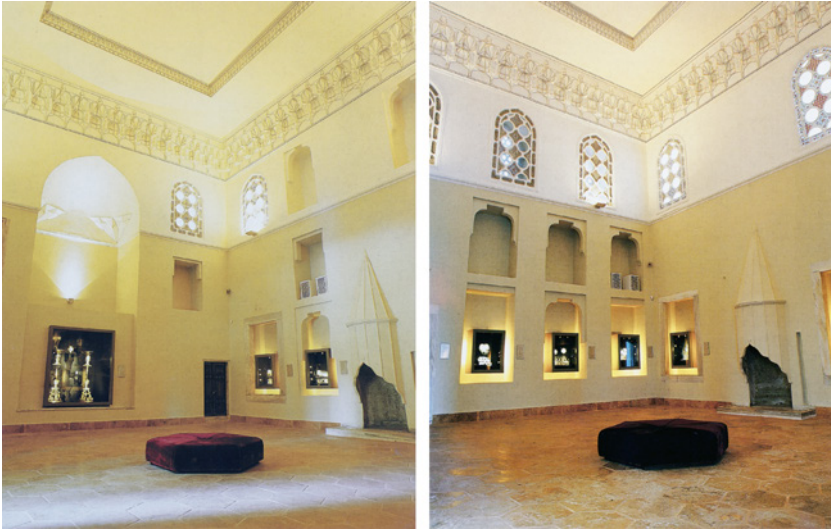
Figures 2a-b Inner Treasury. [Left] Second hall (throne room) interior with throne alcove and fireplace. [Right] First hall interior with multi-tiered niches and fireplace. (Reproduced from Necipoğlu, "The Spatial Organization of Knowledge", 6; Photos: Devrim, "Topkapı Sarayı Müzesi", 90-1)

two volumes by a number of leading contemporary academics with invaluable contextualizations, who commented on each genre based on the scholarship of the day. Observing that the collection encompassed non-Islamic philosophical and scientific works alongside others reminiscent of pre-Islamic universalism, Cemal Kafadar has underscored Mehmed II's universalist and cosmopolitan ambitions in the same line with the competitive post-Timurid scholarly traditions. 104