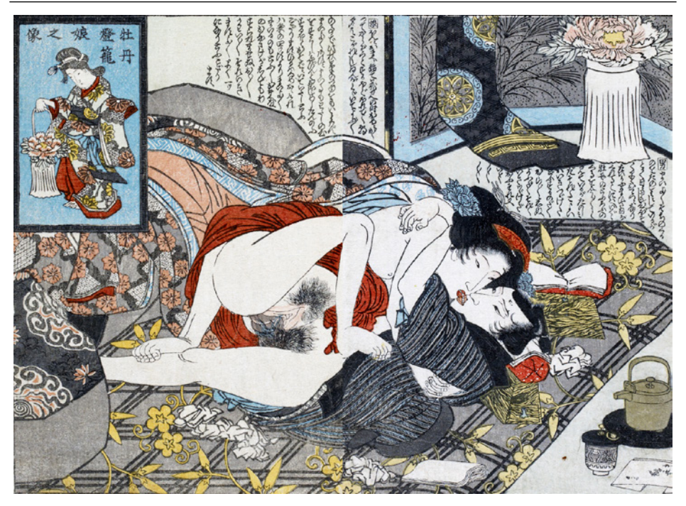
Figure 7. Utagawa Toyokuni (1823). Ehon kaichū kagami . Picture Book: Pocket Mirror, considered innovating for its macabre and violent themes at that time: death and desire as depicted in the Edō Period. Here the love story between a rōnin (masterless samurai) and a ghost woman is featured

ron and nikutaishi dismantles the ontic and ontology. He goes beyond conventional cultural terms concerning the cadaverous, defunctive and defective condition that the concept of death implies, subtly playing with presence and absence and erasing their common definition and perception. Hijikata operates in a context where existence and reality are placed in a different system. He destabilizes the concept of death by dissecting those of existence and presence, and by fragmenting the condition of fuzai (absence) and hizai (non-existence), transforming death into a different form of presence.