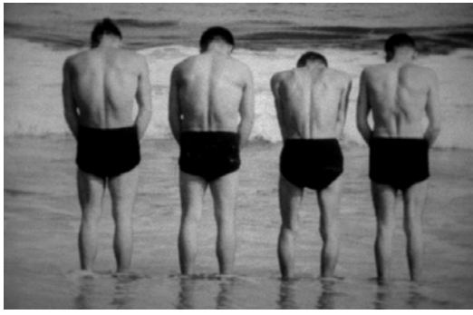
Figure 2. Men standing in a peeing position seen from behind: scene from Heso to genbaku (1960) by Hosoe Eikō (Courtesy Hosoe Eikō)

philia, homoeroticism, murder, sacrifice, viciousness into play. Androgyny and cross-dressing are further deepened in his following projects, such as during the sessions of Hijikata Tatsumi DANCE EXPERIENCE no kai (1960-1961). This early stage of Hijikata's aberrant dance, according to Ichikawa Miyabi's periodization, <sup>14</sup> integrates and elaborates the scabrous literature of Jean Genet, Comte Lautréamont and Marquis de Sade.