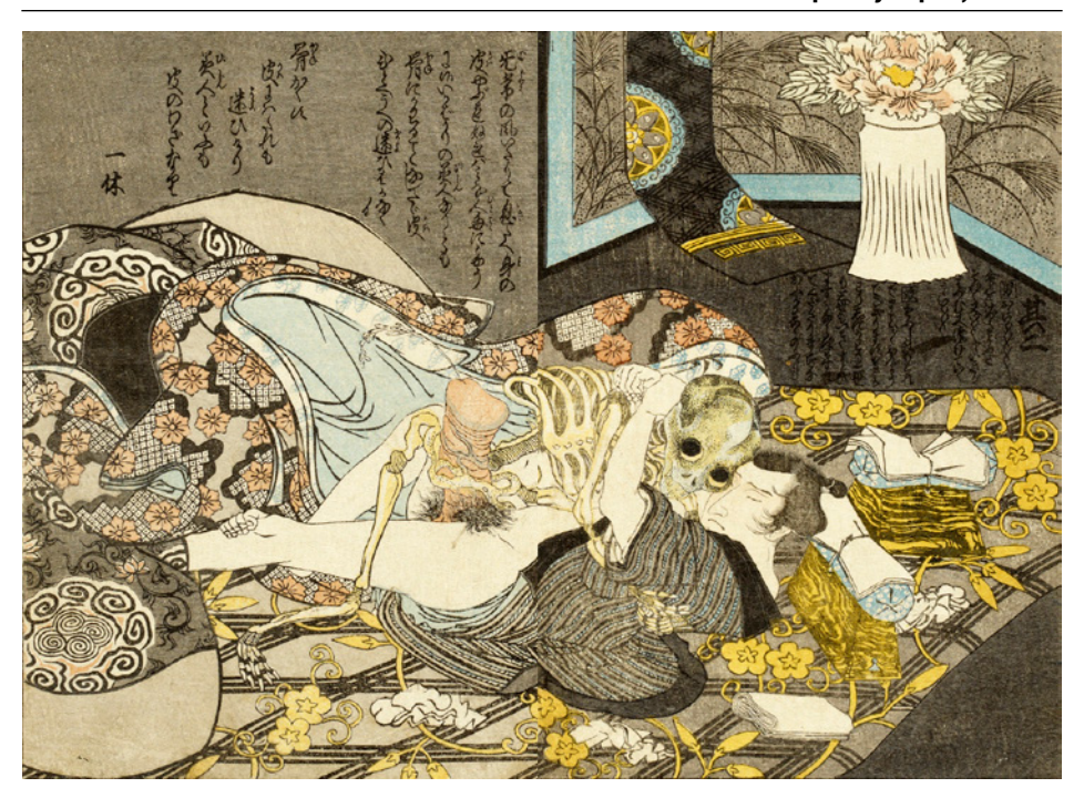
Figure 8. Utagawa Toyokuni (1823). Ehon kaichū kagami . Picture Book: Pocket Mirror. The woman is transformed into a skeleton and the rōnin continues to embrace her

suffering (kug\bar{o}) ,<sup>54</sup> rather than worrying about their sustenance, sacrifice their life in the name of the ideal of death. In his essay "Keimusho e" Hijikata (1961, 48-9) connects his art to Marcuse's thought declaring that the concept of 'provocation' outlined by the philosopher is for him 'dance'. But, as the dancer underlines, this provocation is not addressed if "we lick the wounds of the machine civilization run out of control". In order to oppose "politics that inhales into their breast skeletonised functions" (Hijikata 1961, 49), in this actual situation it is necessary to arm ourself with a blackboard eraser and cancel "the culture of tearful and sorrowful cries, which exists in the carcass of victim mentality", and its signs of an impotent future.