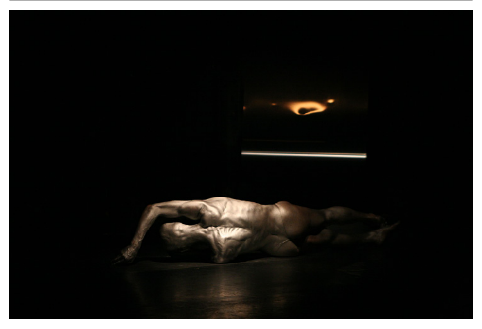
Figure 3. The corporeality of the corpse performed in Murobushi Kō's dance: Murobushi Kō. Quick Silver (2006). Azabu Die Pratze, Tokyo.

In technical and practical terms, this dance, nourished by unbalance and crisis, destroys the common concept of choreography. Linear and geometric movements are further menaced and denied by keiren , convulsive seizures or nervous contractions. These spasms or shivers resemble a dystonic attack that affects one or different parts of the body, or its entire build. Keiren may embody the intersection between the orgasmic apex and tremor mortis . Movement disorders, usually uncontrolled and involuntary, appear as crafted dynamics in this choreutic art. Staged are micro-movements and sometimes infinitesimal shock-like jerks, imperceptible to the eye but deeply sensed by the audience. The teboke (hand senility or tremor occurring in the hands), discussed also by Mishima in terms of Begriff and begreifen (Centonze 2012, 224-5), <sup>19</sup> disarrays the relation between object and body, thus the vectoriality of language and naming.