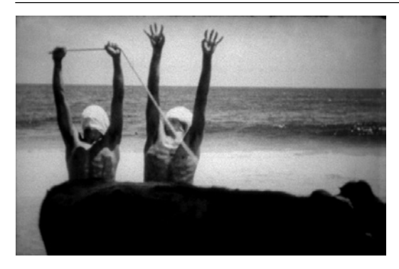
Figure 1. The veiled heads of Hijikata Tatsumi and Ōno Yoshito in Heso to genbaku (1960) by Hosoe Eikō