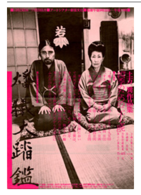
Figure 6. Abe Sada and Hijikata Tatsumi: flyer for Shiki no tame no nijūnanaban (Twentyseven Nights for Four Seasons, 25 October-20 November, 1972). This performance series held at Art Theater Shinjuku Bunka by Hangidaitōkan included also Hōsōtan . The original photo depicting Abe Sada and Hijikata was taken by Fujimori Hideo in 1969 (Courtesy Research Center for the Arts and Arts Administration, Keiō University)

The corpse [ shitai ] is a temporary extinction and resembles landscape [ fūkei ]. Even to this [corpse] stick the bacteria of myth. Our nikutai is a thing which precipitates into life while it already breaks, and we know it through physiology. (Hijikata 1969, 31)