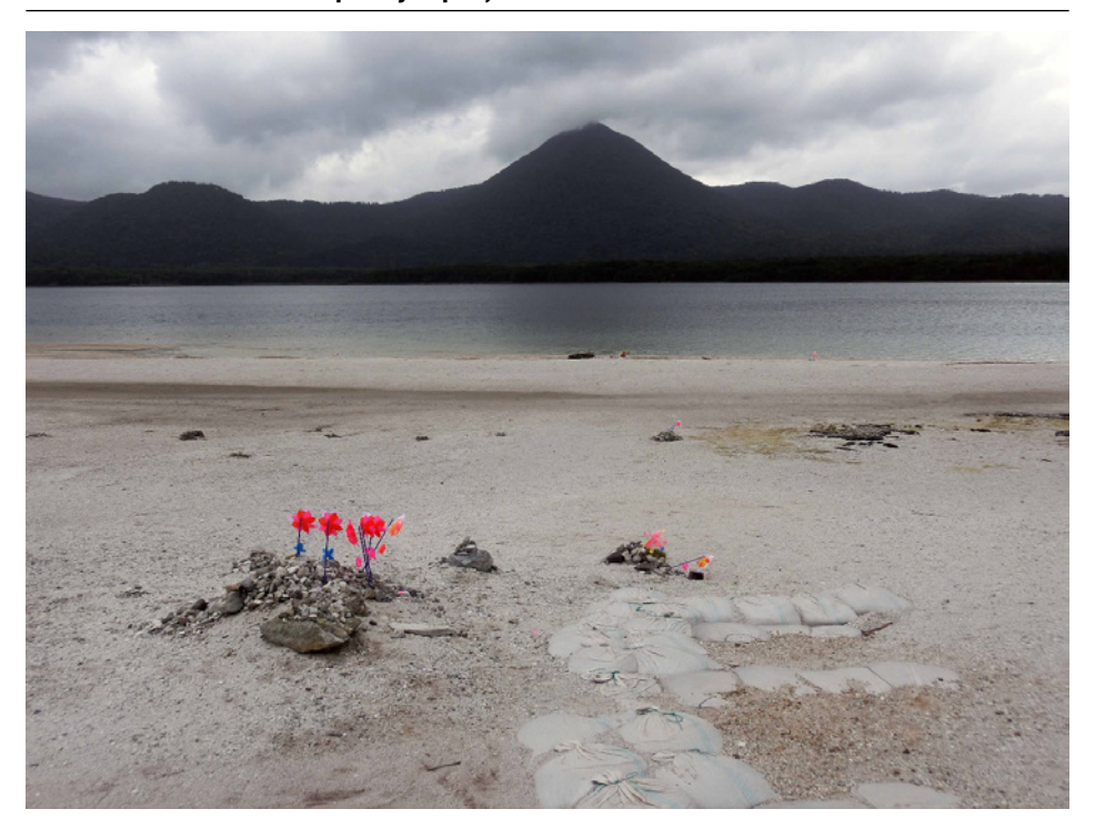
Figure 4. Gokurakuhama (Paradise Beach), one of the spots at Osorezan, the Mountain of Fear in Shimokita Peninsula of Aomori Prefecture. Osorezan is venerated as the door to the dead's world. The peaceful and beautiful area of Gokurakuhama is considered to be the place where the living can meet the deceased by calling their name. Photo by the author (August 2015)

The case "return of the corps" illustrated in Phelan's study (1997, 66-8), which deeply explores female corporeality in relation to psychic events and where problems concerning truth and time<sup>44</sup> – although declassified – are still at play, is linked to traumatic experiences and symptomatic manifestations. Conversely, in butō we may speak of the 'return of the corpse'. The appearance or presence of the dead in Ōno Kazuo and Hijikata's dance is detached from psychoanalytic processes. Present and past are not questioned. It is difficult to discern in Ōno Kazuo and Hijikata the common sense of mourning or grief. There is no loss of the (dead) person's presence. Rather, their dead-dance, although different from each other, unfolds a sort of parousia , taken in its etymological sense of physical presence or arrival – both incorporate feminine bodies/corpses and consequently pro-