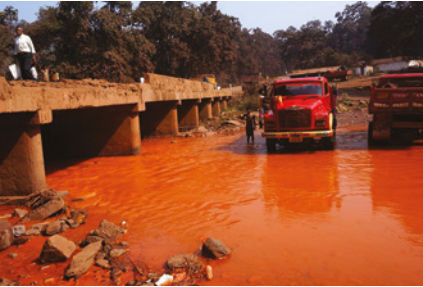
Figure 1 River Bonai 2016.

garh (including Bonai). 7 Bonai itself, it was estimated, covered roughly 25% of the sum.