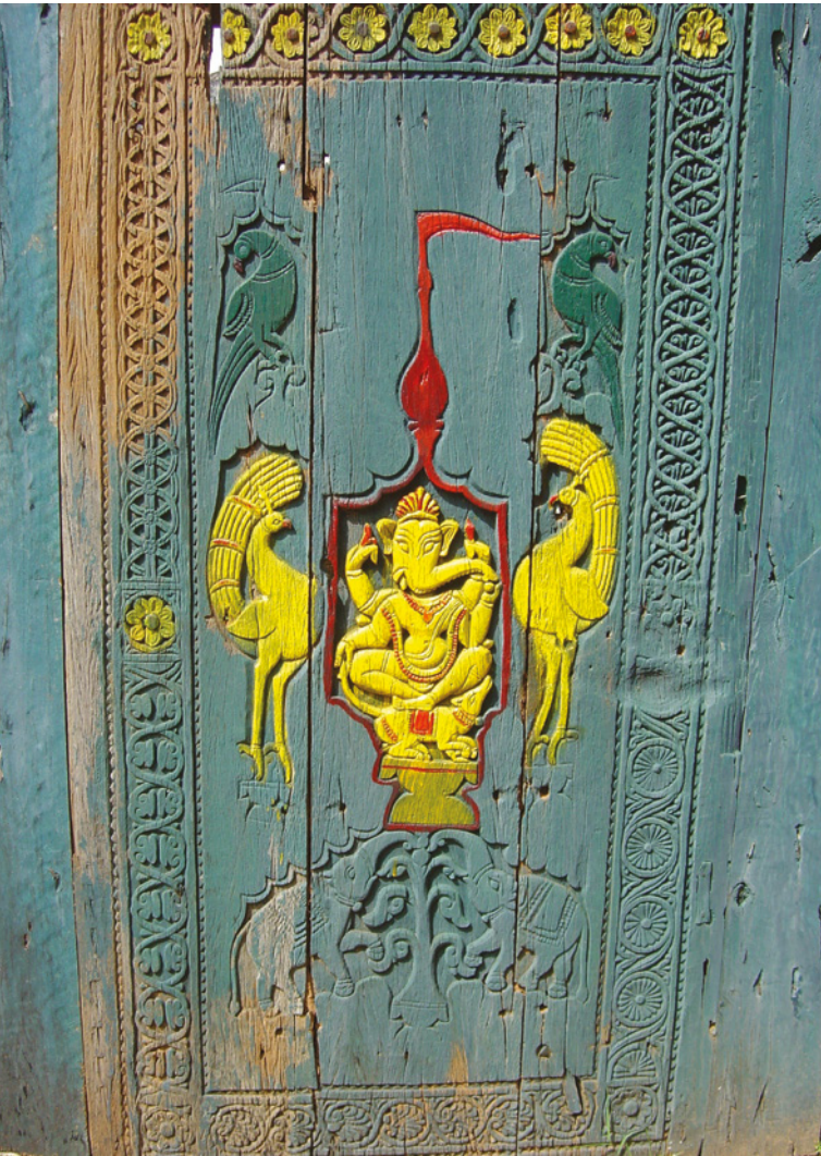
Figure 3 Peacock in a door at the palace.