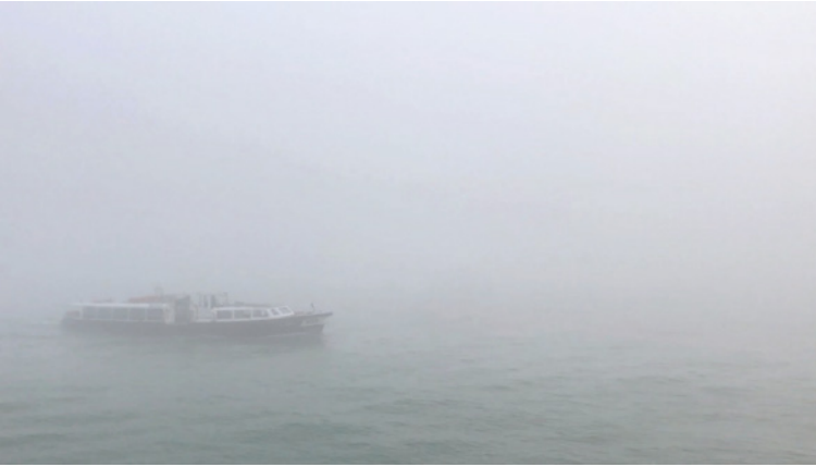
Figure 2 Vaporetto at Madonna dell'Orto October 20, 2020, 09.06 am.

what was made uncertain or 'obliterated' by fog is physically and socially embodied as a gathering force or mediating element of political matters across geographies and through wheezing bodies. A similar scene can be imagined drawing bodies into trans-corporeal connection in Venice. In this way Dickens mobilises fog as both a metaphorical and a very material condition of meteorological connection and social awareness. From this socio-environmental gathering-force, I turn towards what is mediated by fog, both physically and psychologically, in the cinematic treatment of toxic airs.