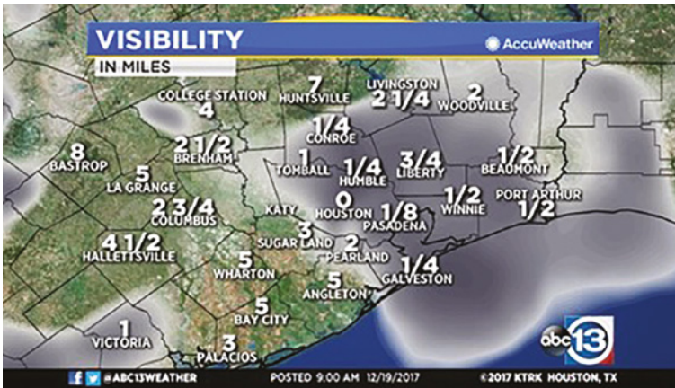
Figure 3 Tweet from @abc13weather, December 19, 2017