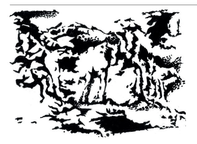
Figure 2 Horses.

so prompted. In actual fact, that perceptual phenomenal change may occur also in other cases, in which what one experientially perceives now as different with respect to what one experientially perceived before is precisely what one expects. Consider an example provided by Cavedon-Taylor (2017) that involves a tactile perceptual experience. After a dental operation, in accordance with one's expectations one may experientially perceive in a tactile mode that the extracted tooth is no longer there, in a certain part of one's mouth. For MPP, what one now enjoys as phenomenally different from one's previous perceptual experience of that part of one's mouth is the tactile perceptual experience of the lateral surfaces of the teeth that flanked the extracted tooth, which were previously occluded by that tooth.<sup>13</sup>