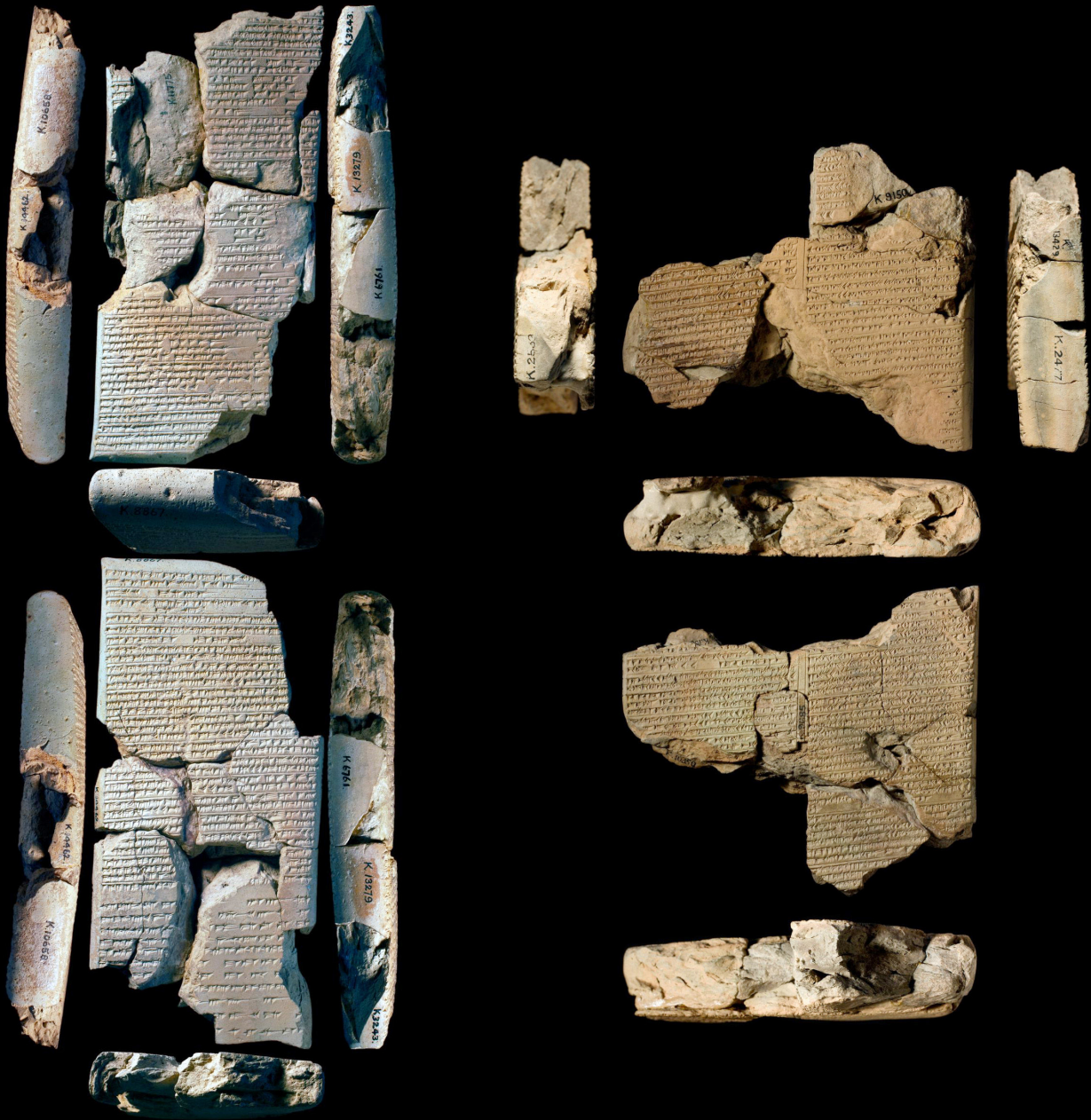
Figure 5 Treatments against ghost-induced ailments, recorded on tablets in two different formats. Nineveh, Iraq, K. 3243+ (left) and K. 2477+ (right). © The Trustees of the British Museum. Shared under a Creative Commons Attribution-NonCommercial-ShareAlike 4.0 International (CC BY-NC-SA 4.0) licence