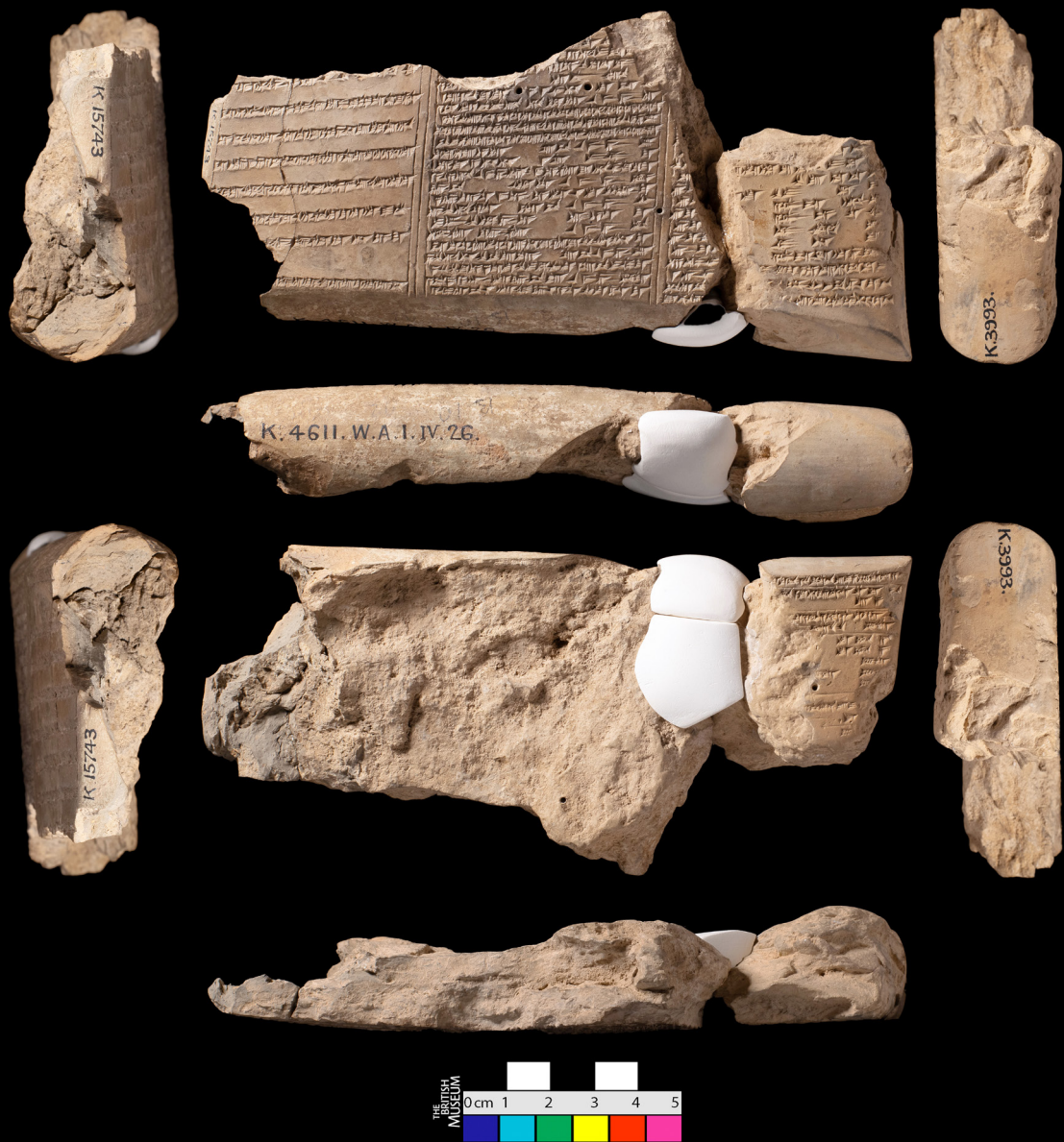
Figure 2 Three-column tablet, which most likely represents a manuscript of the Nineveh Medical Compendium, with colophon q and an extensive collection of treatments for skin ailments. Nineveh, Iraq, K.3993+.