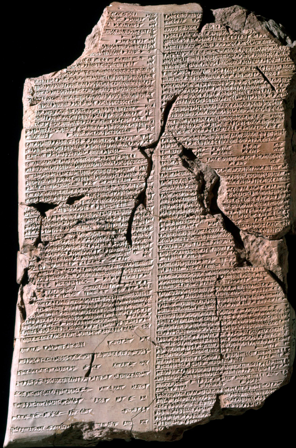
Figure 1 The best-preserved part of the Nineveh Medical Encyclopaedia, a manuscript of the second chapter of the gastrointestinal treatise Stomach. Nineveh, Iraq, K.71B. © The Trustees of the British Museum. Shared under a Creative Commons Attribution-NonCommercial-ShareAlike 4.0 International (CC BY-NC-SA 4.0) licence