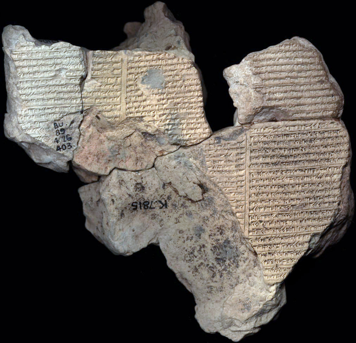
Figure 3 Three-column tablet with an extensive collection of treatments for skin ailments. The tablet may represent another manuscript of the Nineveh Medical Compendium. Nineveh, Iraq, K.7815. © The Trustees of the British Museum. Shared under a Creative Commons Attribution-NonCommercial-ShareAlike 4.0 International (CC BY-NC-SA 4.0) licence