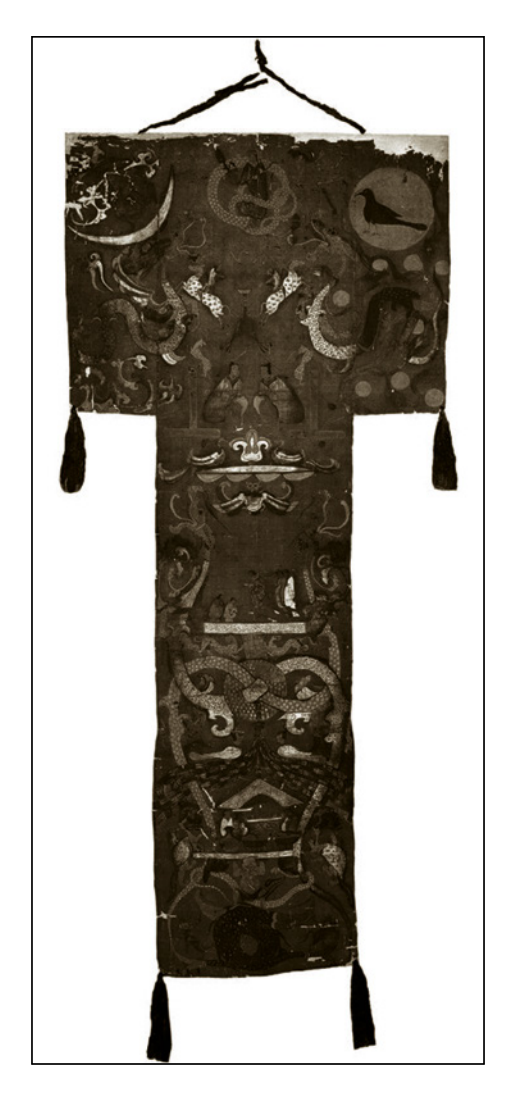
Figure 2 T-shaped banner from Măwángduī (cf. Wang 2011, 40 fig. 3)