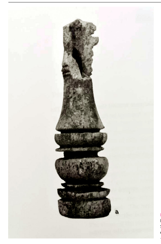
Figure 10 Elongated ear pendant from Saidu Sharif I, S 2336, L, 9.3 cm; diam, 2.4 cm. © Callieri 1989, fig. 135

Examples from excavations at the proto-historic site of Kalako-deray as well as the urban settlement of Barikot in Swat point to the fact that such ear ornaments long remained in fashion in this region. They were worn by the urban laity in the early centuries of the Common Era up until late antiquity (Micheli 2007; Olivieri 2022b, 266). It is, therefore, hardly surprising that some of the ear ornament motifs from the archaeological record are replicated on the donor portraits from Butkara I. For example, specimens of discoidal earplugs with concentric circles from Barikot [fig. 8] closely mirror the earplugs worn by the male donor figure from Swat Museum. The ear pendant from Saidu Sharif I is a decorated version of those worn by numerous male and female donor figures from Butkara I and other early Buddhist sites in Swat. The use of indigenous Indic ornaments