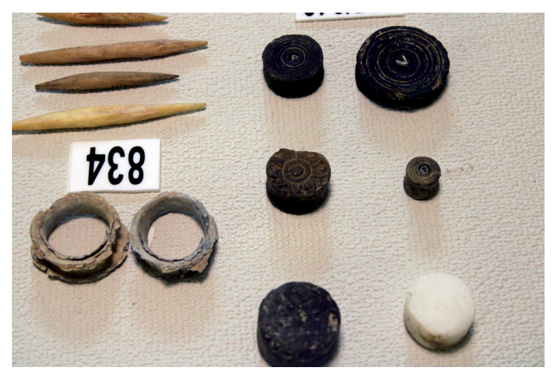
Figure 9 Earplugs from Barikot, Swat, Swat Museum