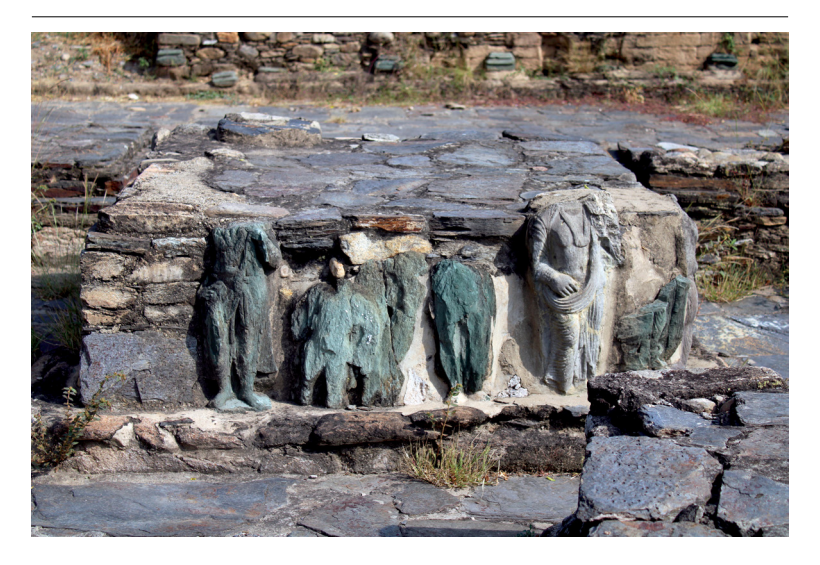
Figure 2 In situ fragmentary statues reused on a minor stupa at Butkara I.

leaving us with several extant heads and headless, fragmentary bodies. A large part of the work, however, comes from the sacred precinct of the monastic establishment between the Great Stupa and the Great Building in stratum IV. This was a space that was restructured and renovated in the beginning of the first century CE (Faccenna, Callieri, Filigenzi 2003, 282-6) under the patronage of local dynasties, governing under the Sakas and later the Parthians (Callieri, Filigenzi 2002, 59; Olivieri 2022a).