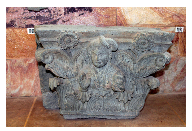
Figure 11 Figured Gandharan-Corinthian capital. Swat Museum.

broader political currents in the region.<sup>41</sup> The recurrent use of a hand gesture in the iconography of donor figures from Butkara I is particularly striking in this regard. Both the donor lady and the male donor [figs 5, 7] are portrayed with their right hands raised in a gesture with the open palm facing outward.<sup>42</sup> The gesture of the raised hand with the outward facing palm is encountered in several other donor figures (both statues and relief panels) from Butkara I as well as other sites in Swat such as Panr I, Butkara III etc. A female donor bust on a Gandharan-Corinthian capital from Butkara I is also portrayed making this gesture with her right hand as she holds a reliquary in her left hand [fig. 11].<sup>43</sup> Moreover, a figured Corinthian capital all the way from Surkh Kotal also bears a male bust with his right hand raised in a similar fashion and the left holding out an offering (Cap. 142.5, Tissot 2006, 64).<sup>44</sup>