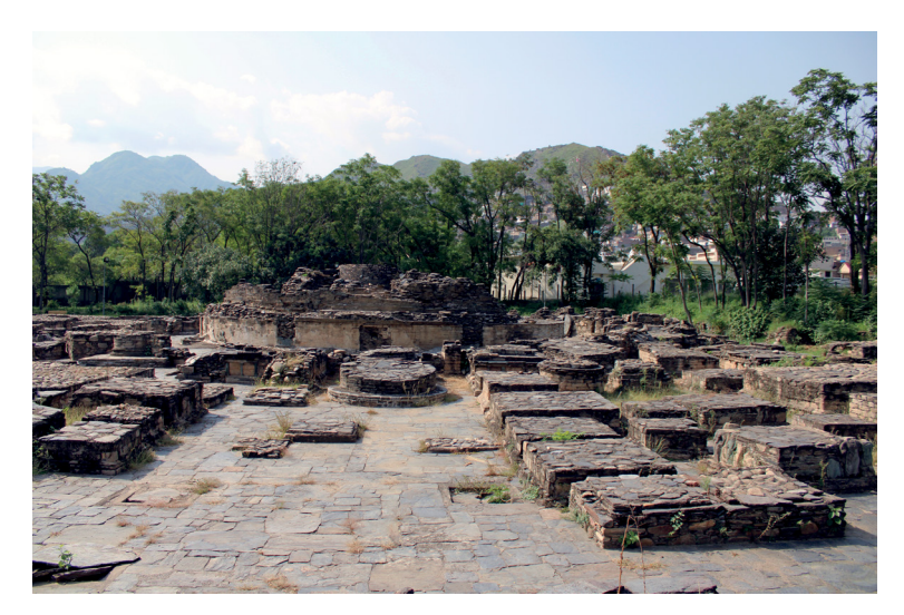
Figure 1 View of the sacred area of Butkara I.

Kushan period. Furthermore, exploring the explanatory power of this sculpture through the concepts of materiality and performativity enables us to understand the social interactions and religious implications of sculpted donor figures in the Buddhist sanctuaries of Swat.