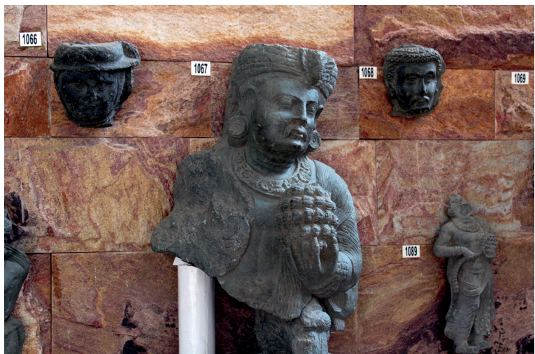
Figure 6 Statue of an aristocratic lady. Inv. No. 194. Swat Museum.