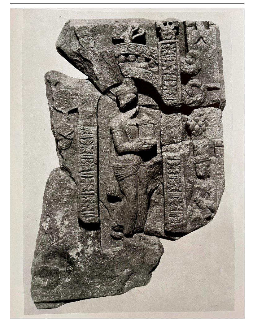
Figure 3 Relief with an aristocratic donor under torana. Inv. No. 895.

discussed by Pia Brancaccio (2006) in her analysis on the ubiquity of figured arches in early Gandharan imagery from Swat. Brancaccio suggests that architectural elements framing a variety of donors and devotees, clad in local and non-local attire, are visual and metaphoric representations of devotional gateways into the world of Buddhism. It thus becomes increasingly clear that the numerous green schist donor statues and statuettes from Butkara I were also conceived of