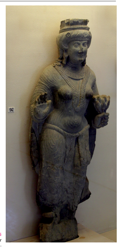
Figure 5 Donor lady. Inv. No. 6000. Swat Museum.

rows, the folds in the neck and the articulation of a conspicuous cleft chin are all elements that collectively convey a strikingly individualized treatment of the face.