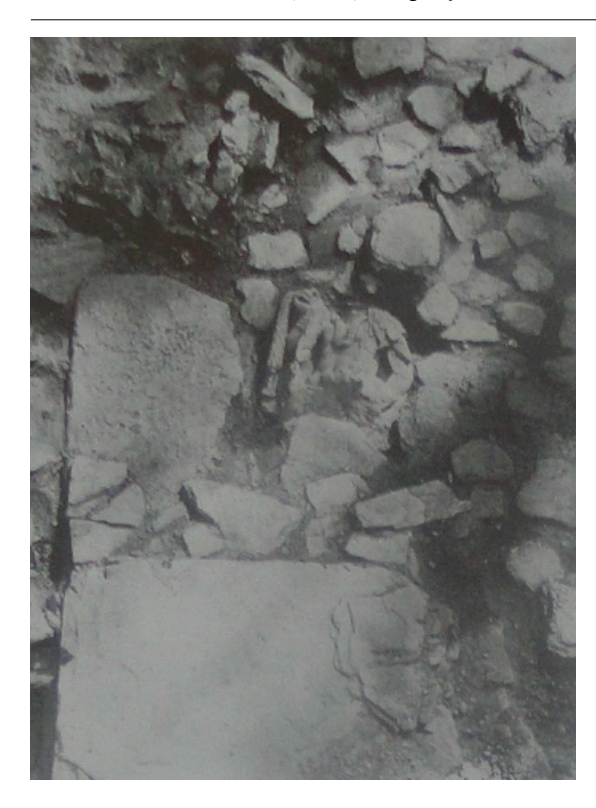
Figure 4 Fragmentary torso of male donor in Stupa 27. Butkara I.

over her arms. While the drapery is rendered in schematic parallel grooves, its diaphanous quality, clinging close to the body and revealing the curves beneath, clearly betrays a parallel interest in the organic, naturalistic treatment of the female body. The small breasts with clearly articulated nipples, slight bulge of the belly, pronounced hips, rounded thighs and protruding knees etc., are all made visible through the thin drapes. The female is arrayed in a variety of jewels including necklaces, ear ornaments, bangles, hairpins, and anklets. Her hair is arranged in a very particular style: a fringe falls over her forehead and temples, curled locks lie on her shoulders, while the rest of the hair is gathered in a wide knot at the top of the head and loosely bound by strings of beads. Although the lack of inscription makes it impossible to identify the subject, the strong interest in individuating her face through the inclusion of specific details indicates that this image was intended as the representation of an actual person. Thin sensitively modelled eyebrows arching over upwards gazing, expressive eyes, the heavy eyelids, the small mouth with a slightly larger upper lip and a prominent nose with deeply carved nasal fur-